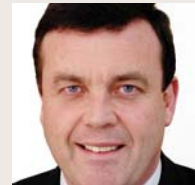
Minister for Finance, Brian Lenihan TD.