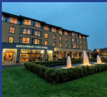
Mullingar Park Hotel