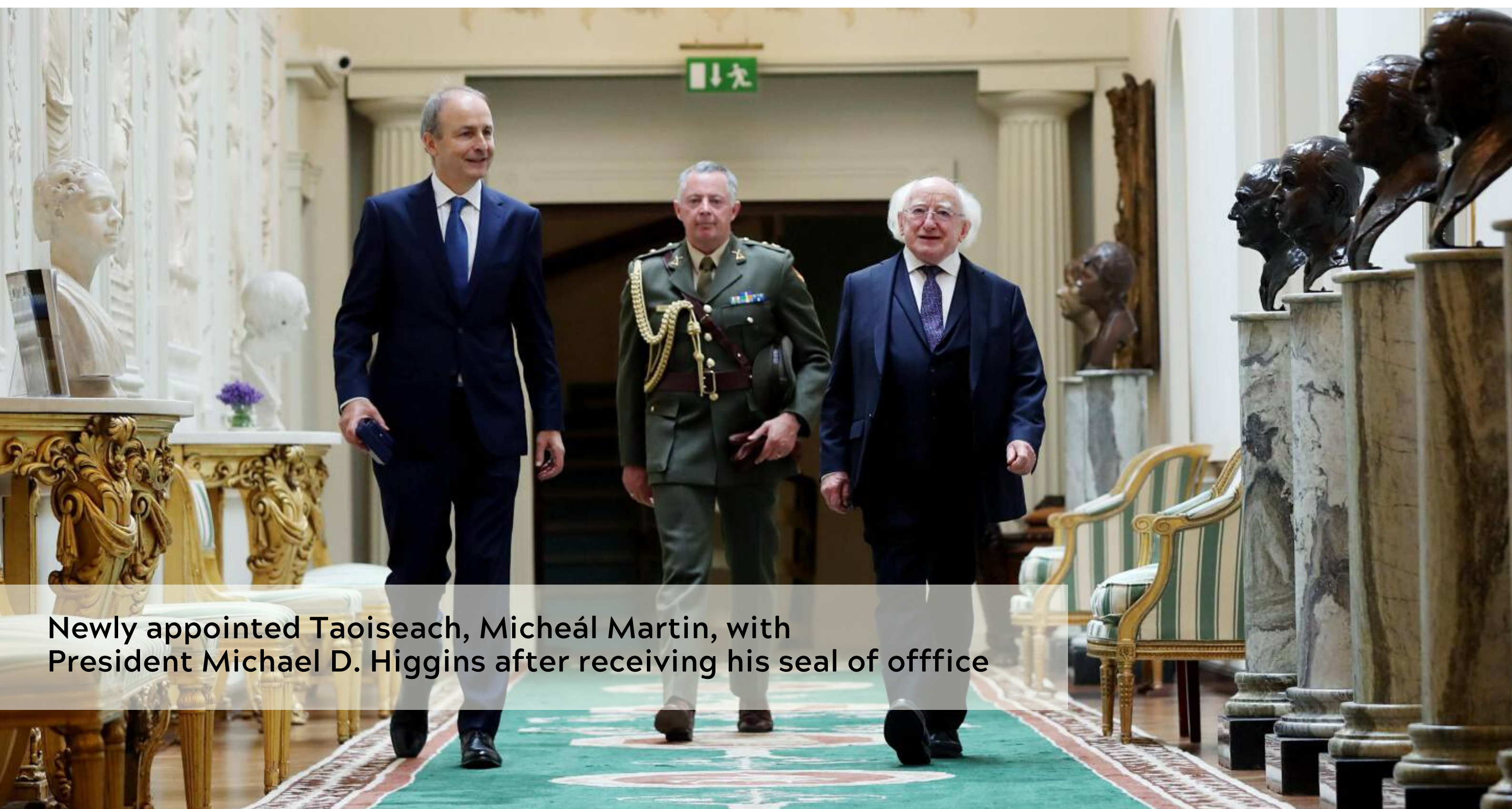
Newly appointed Taoiseach, Micheál Martin, with President Michael D. Higgins after receiving his seal of office

The Attorney General and the Secretary General of the Department of An Taoiseach also attend cabinet meetings.