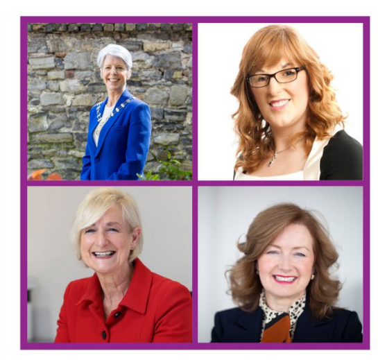
International Woman's Day

Institute of Professional Auctioneers & Valuers