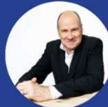
Ivan Yates Irish broadcaster, businessman & former politician